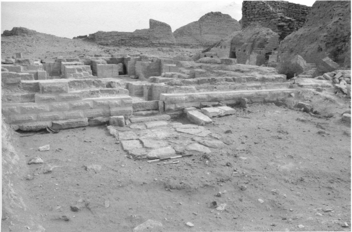
Fig. 2 Late Antique floor in front of the west door in ST 20.